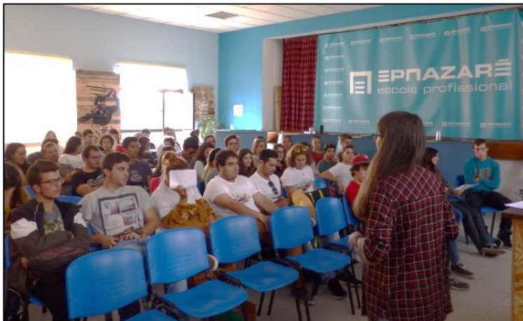
Knowledge sessions in schools