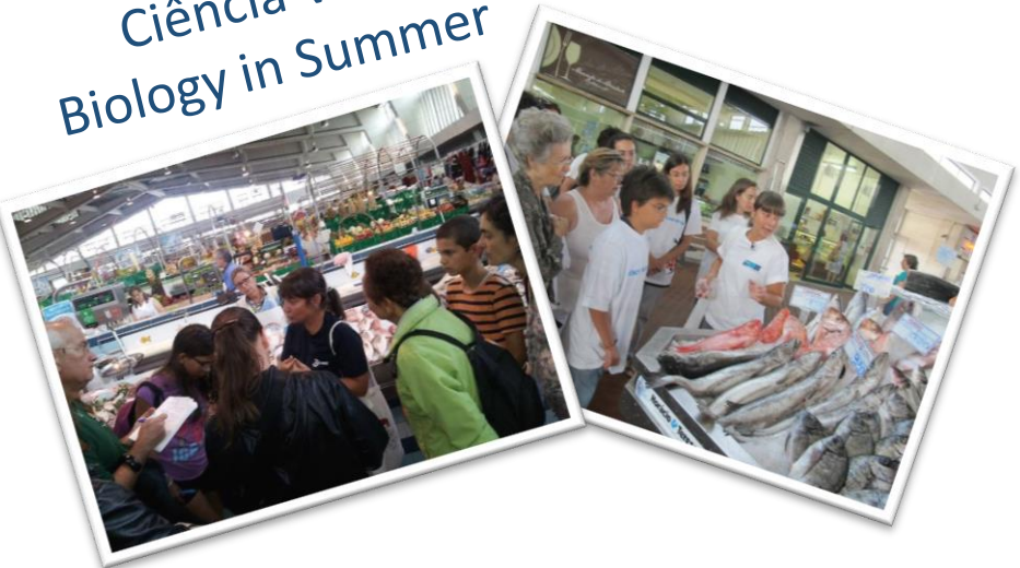
Ciência Viva Biology in Summer