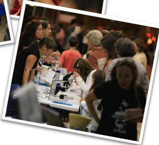
Workshop "Science in Lisbon"