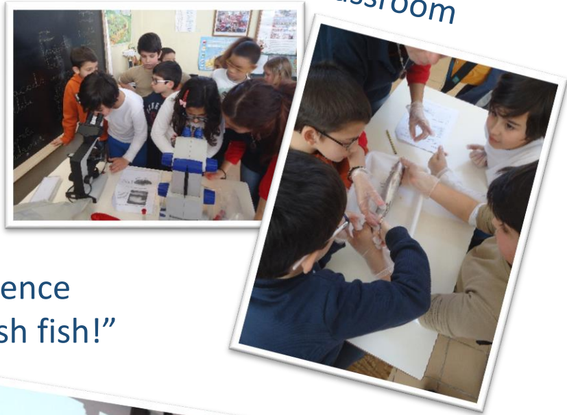
Mini-conference "Come buy fresh fish!"