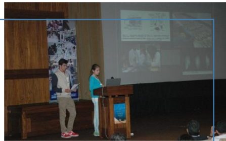
3 – Communication

1 st stage – Beginning of the research work (in the classroom) through the implementation of teaching strategies of inquiry nature.