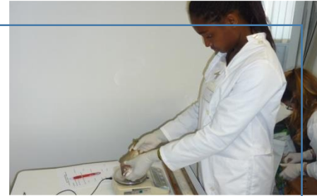
2 – Research